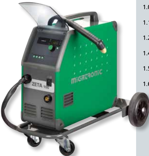
Zeta 100 on trolley (optional equipment, art. no. 78857044/78857045)