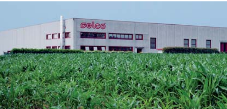
The factory in Cittadella (Padua-Italy)